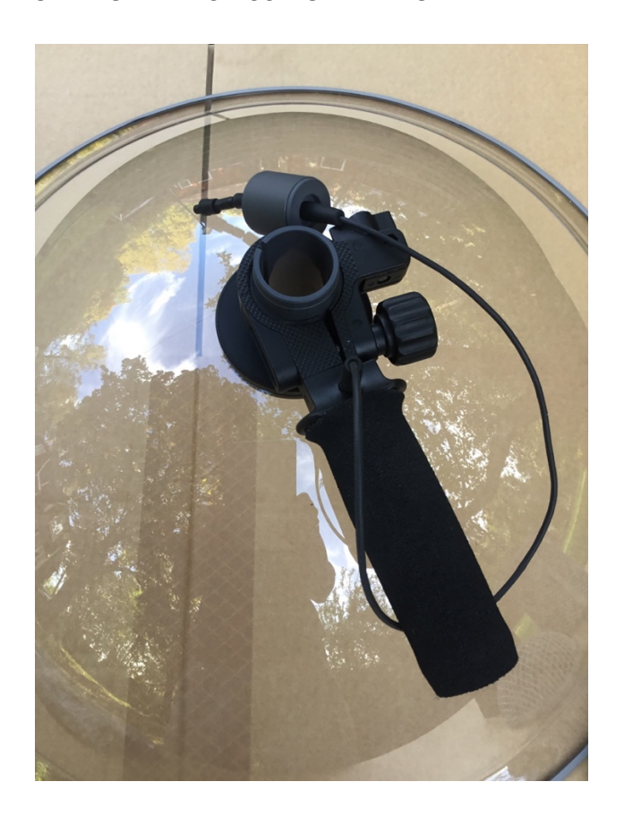
STEP 2. FASTEN AND SECURE THE HANDLE TO THE MOUNTING KIT HOLDING THE DISH USING THE KNOB.