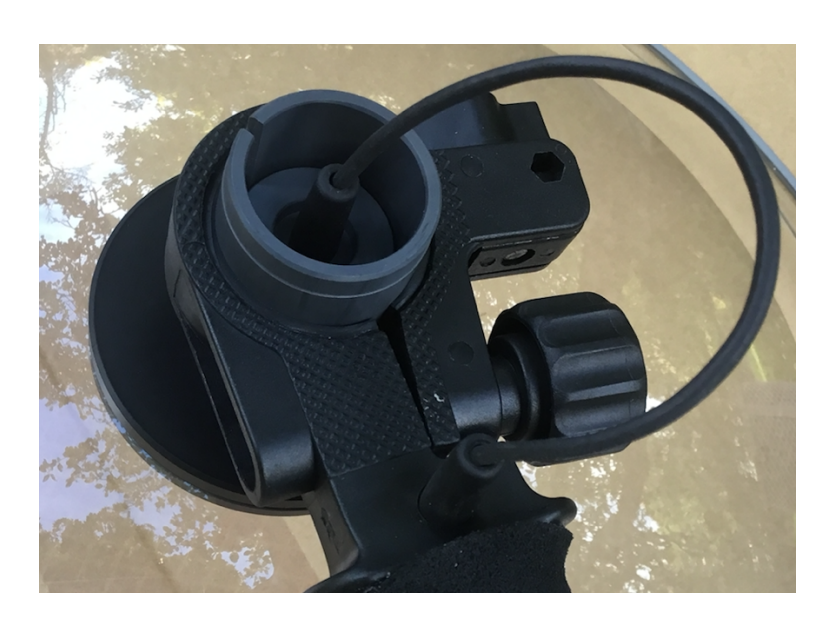
STEP 3. SECURE THE HANDLE CYLINDER "STOPPER" ATTACHED TO CABLE INSIDE THE TUBE WITH THE CABLE GROMMIT ALIGNED BACK OF TUBE *PLACED AS PHOTO TIP! LOOSEN UP THE KNOB, PLACE CYLINDER INSIDE, THEN SECURE KNOB AGAIN. STEP 4. REMOVE THE FRONT CAP OF THE RYCOTE MICROPHONE HOLDER AND TAKE OUT THE BLACK FOAM COMPLETELY OUT OF THE HOLDER.