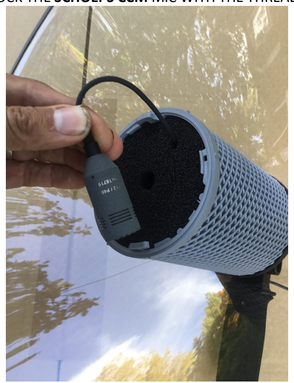
STEP 7. ATTACH AND LOCK THE SCHOEPS CCM MIC WITH THE THREAD SCREW.

(IMPORTANT: PULL GENTLY OUT THE CABLE ALLOWING TO MOUNT MICROPHONE AS NEXT STEP WITH A GENEROUS CABLE U-BEND)