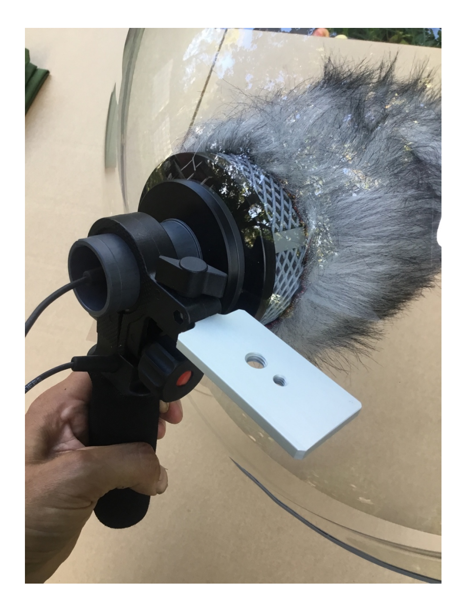
OPTIONAL: ATTACHING THE RYCOTE WIND JAMMER AND TRIPOD MOUNT.

( PHOTO: LOOSEN UP THE TOP SCREW OF THE HANDLE , SLIDE IN THE TRIPOD MOUNT AND THE SECURE AGAIN THE TOP SCREW)