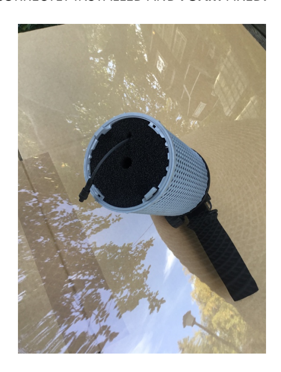
STEP 6. HANDLE CABLE CORRECTLY INSTALLED AND FOAM FIXED.

(IMPORTANT: PULL GENTLY OUT THE CABLE ALLOWING TO MOUNT MICROPHONE AS NEXT STEP WITH A GENEROUS CABLE U-BEND)